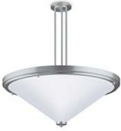
Three Stem Option