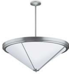
Four Arms Over Diffuser Option

www.ScottArchLighting.com | Tel (707) 864-2172 | Fax (707) 864-2182 © Copyright 2024 Scott Architectural Lighting. All Rights Reserved. Made in the USA.